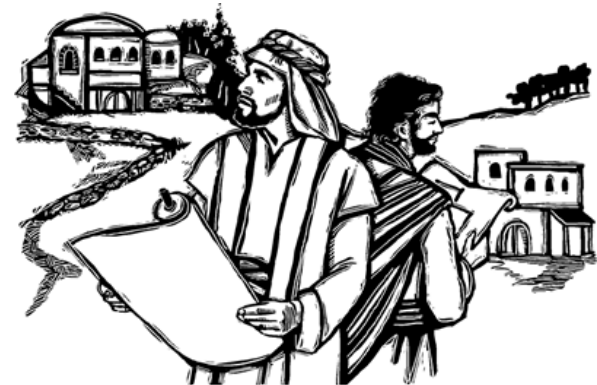
The Wise and Foolish Builders Matthew 7:24-27